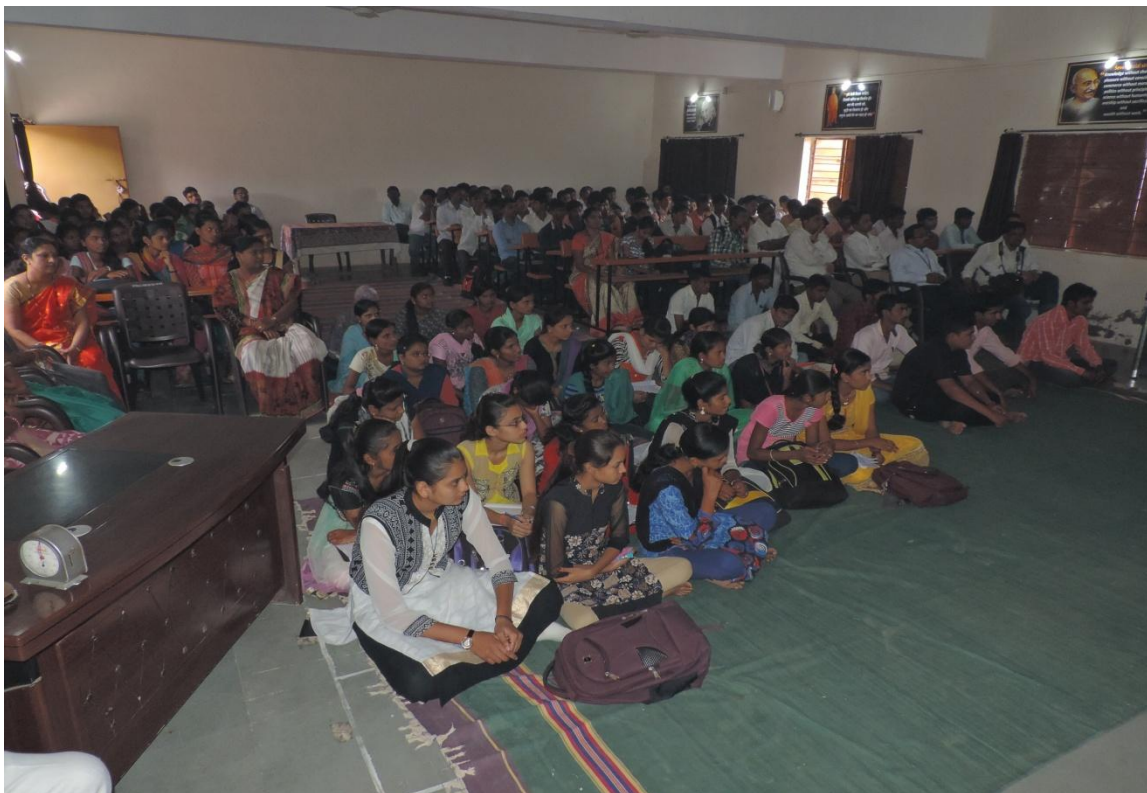
Celebrating of Hindi Divas Samaroh By Dept.of Hindi