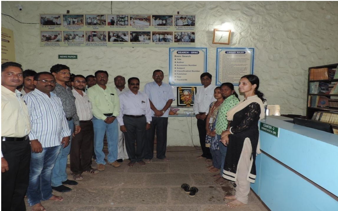
On Occasion Of “Premchand Jayanti”